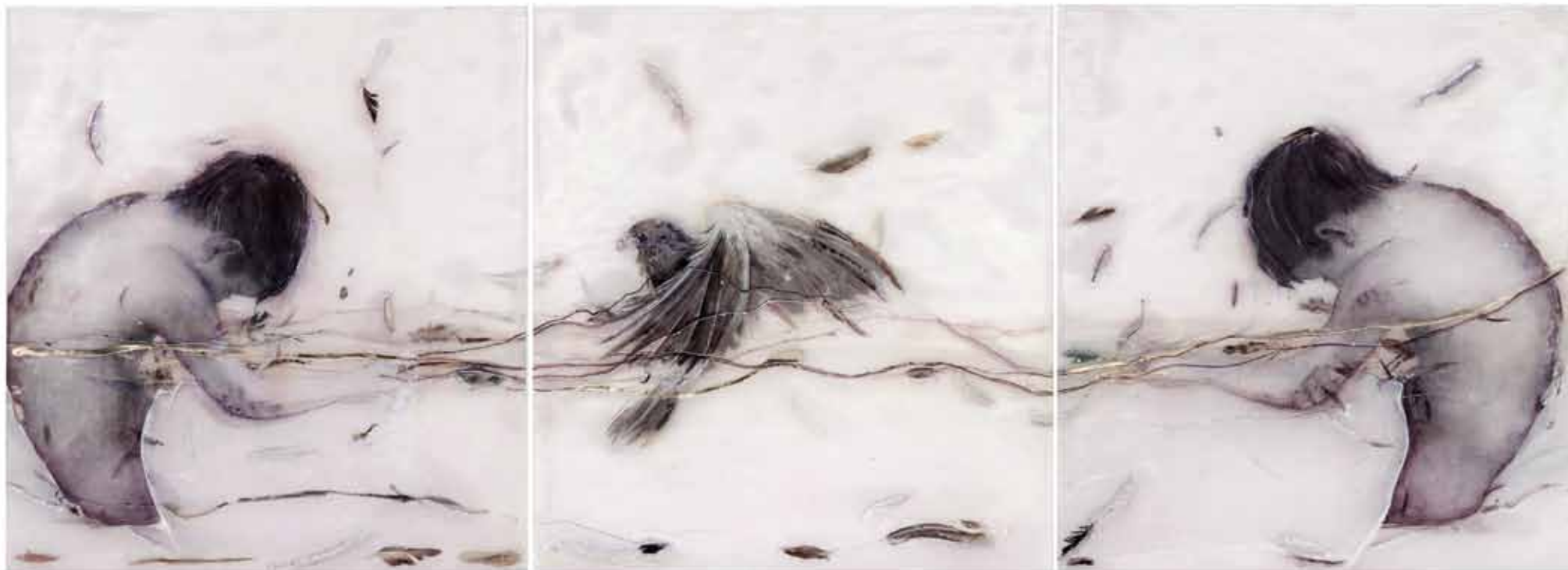
Sibylle Peretti, Holding Birds, carved, engraved, painted and silvered Plexiglas, 30" x 78" x 1", 2014.