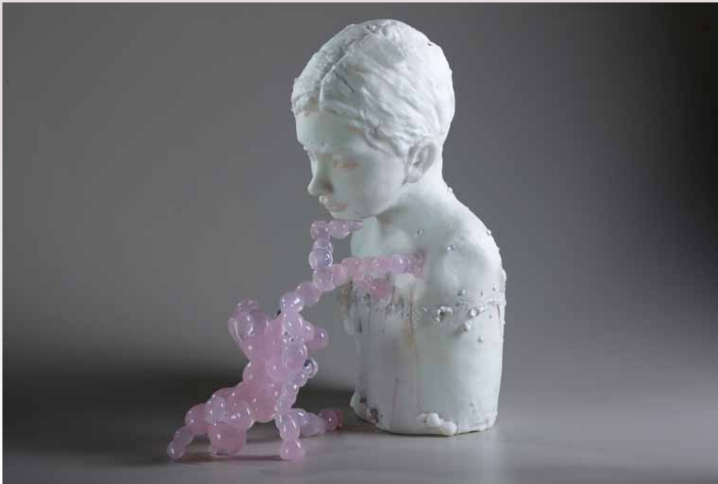
Sibylle Peretti, Wunderkind, kiln cast and hot sculpted glass, engraved, pigments, 19"x 15" x 11", 2012.