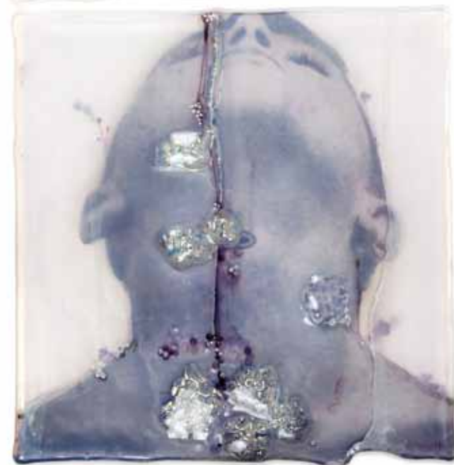
Sibylle Peretti, I Search in Snow 8 , kiln formed glass, silvered, engraved painted, 20" x 10", 2014.