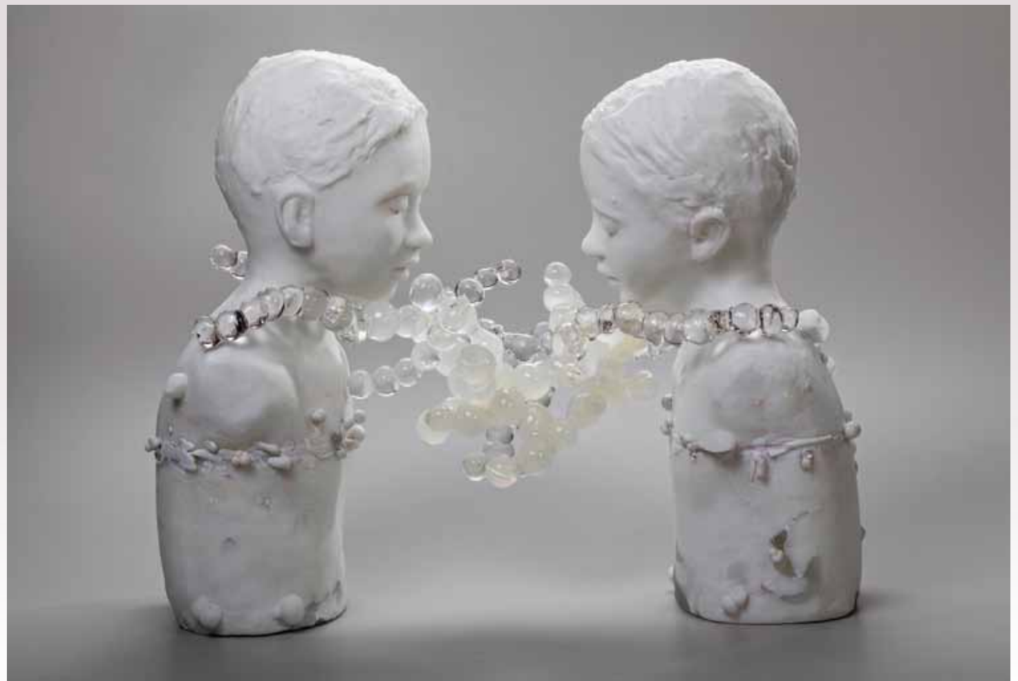
Sibylle Peretti, Thaw, kiln cast and hot sculpted glass, engraved, pigments, 18" x 26" x 11", 2012.