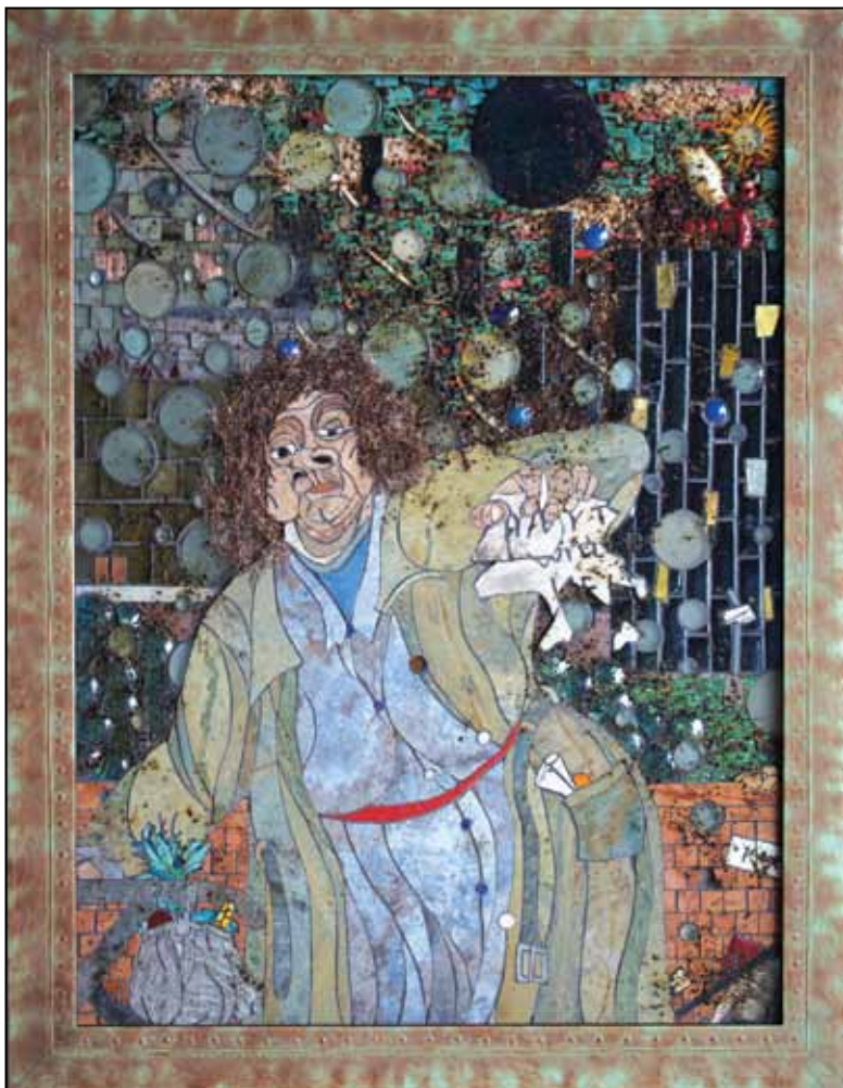
Brooks Tower, The Valley