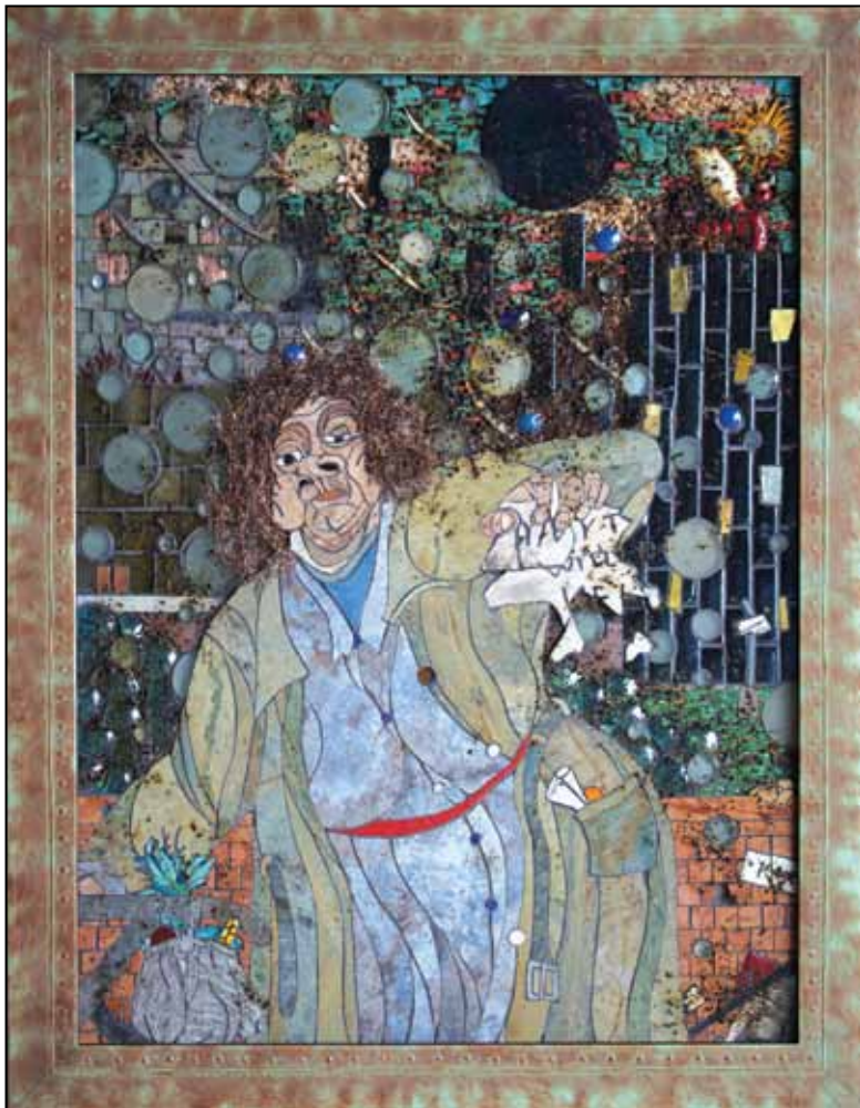
Brooks Tower, The Valley