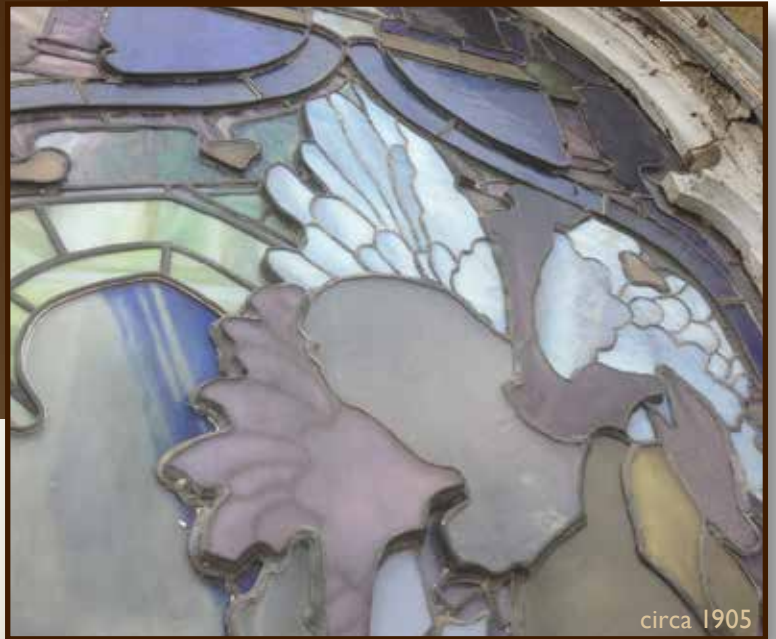
Plating on Tiffany window.

Meet this year's instructors and discover what educational opportunities await: