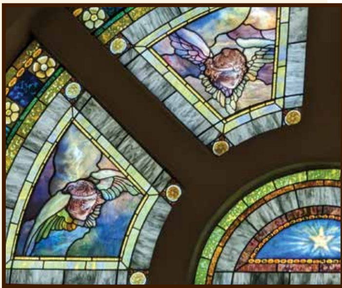
Details of the Goodspeed Memorial Window: Christ Blessing Little Children, in Broad Street Presbyterian Church created by the Louis Comfort Tiffany Studios. The rectangular panes in total 12' high x 20' wide.