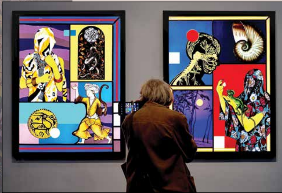
Amir Fallah, Silent Traveler and The Artifacts Left Behind , stained and fused glass, lead, aluminum frame, custom lead pane, Photo courtesy of Tala Harden.