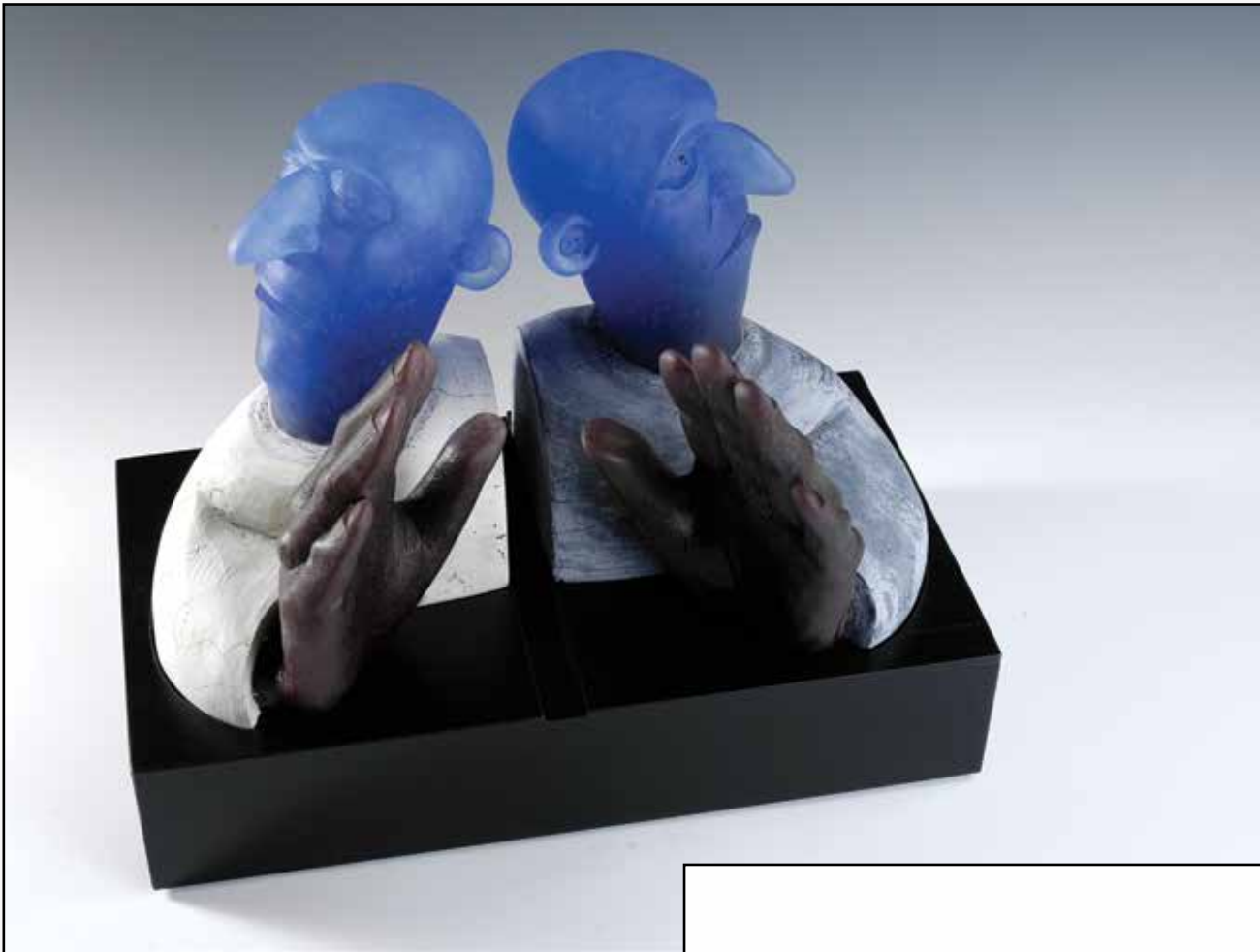
David Reekie, The Wall Between Us II , lost wax cast glass, 30 cm x 40 cm x 25 cm, 2018.