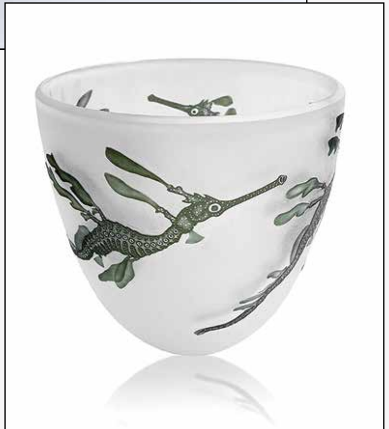
Katharine Coleman, Seahorses Bowl , glass cut and polished with drill and wheel engraving, 23.2 cm x 23.7 cm, 2023.

The World of Glass is a local museum and visitor center in St. Helens, Merseyside, England, that is dedicated to the local history of the town and borough primarily through the lens of the glass industry. The Museum was founded in 2000 and is an amalgamation of the former Pilkington Glass and St. Helens Borough Council Collections. The purpose-built premises was constructed adjacent to Pilkington's glassworks and the stretch of the St. Helens Canal known as the "Hotties."