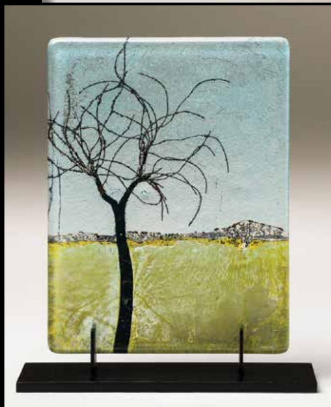
(Above) Wendy Newhofer, Parched , kiln formed glass, 17 cm x 13 cm, 2023.