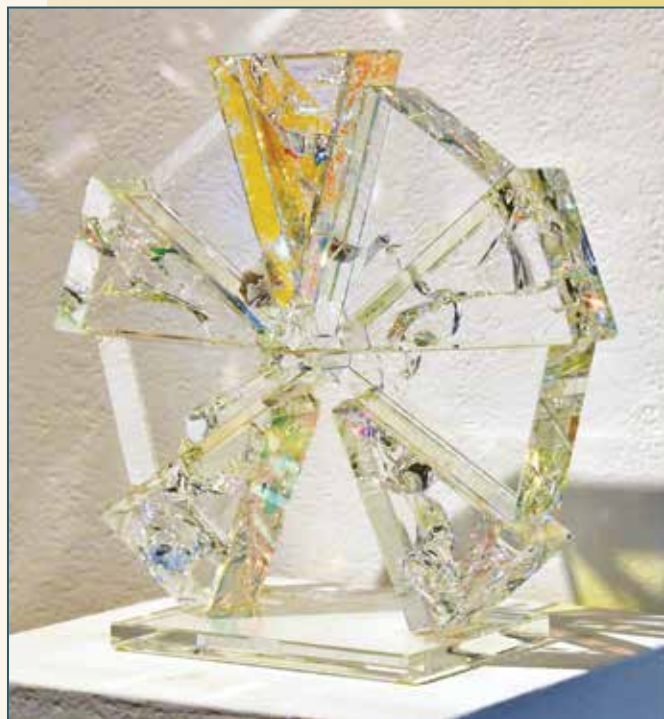
Tom Marosz, Dino's Wheel, dichroic-coated optical glass shattered and cold worked, 12" x 12" x 5", 2022.