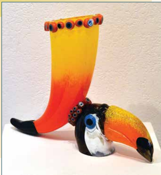
Kathleen Mitchell, Toucan Rhyton, blown glass, 10" x 10" x 4", 2022.