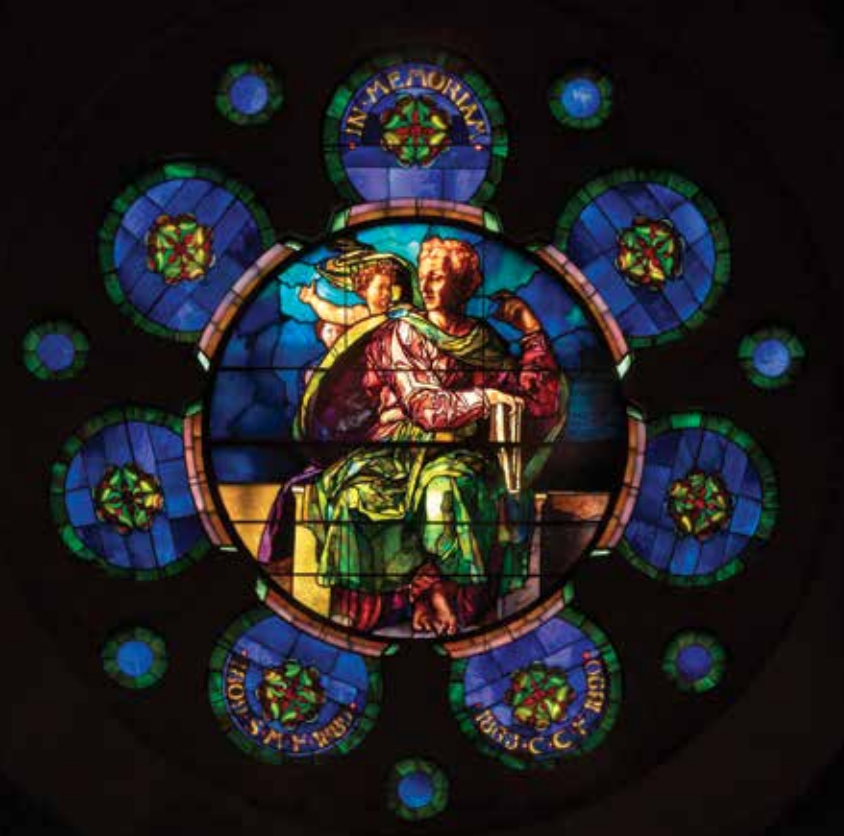
(Above) John La Farge, Isaiah Rose Window at the featured presentation on the La Farge restoration at the First Unitarian Church of Philadelphia.