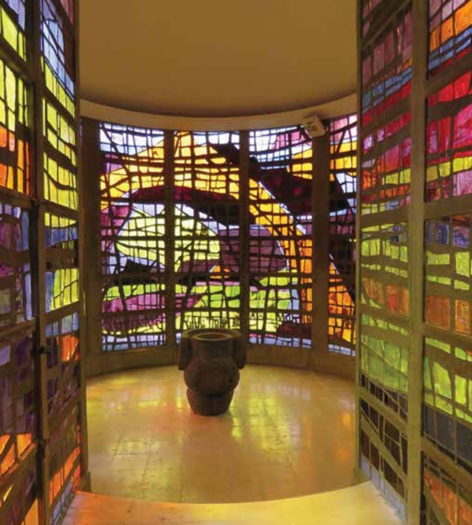
Dalle de Verre glasswork at Église Du Sacré-Coeur.

glass art are donated, and a preview of donated items will be featured on our Facebook page as we lead up to the event. The auction benefits the AGG's educational mission and James Whitney Scholarship Fund, providing support for training, workshops, and conference attendance, both in the United States and abroad. Our auction is the sole support of our scholarship fund, and we thank everyone for their continued support.