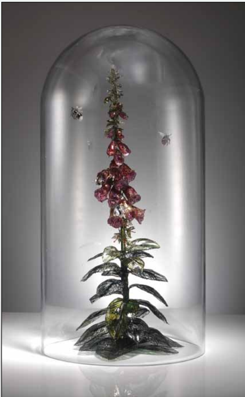
Sandra Young, Foxglove.

The exhibitions all set out to demonstrate just how utterly glorious and amazing contemporary glass is so that everyone can appreciate and enjoy its magical colors, textures, use of light, and variety of methods. The work displayed will feature a wide range of techniques including hot blown forms, fused glass, stained glass panels, pâte de verre, and cast glass. The artists are featured along with their personal explanation of why glass is glorious to them and why they have chosen the pieces on display to express that passion for their chosen material.