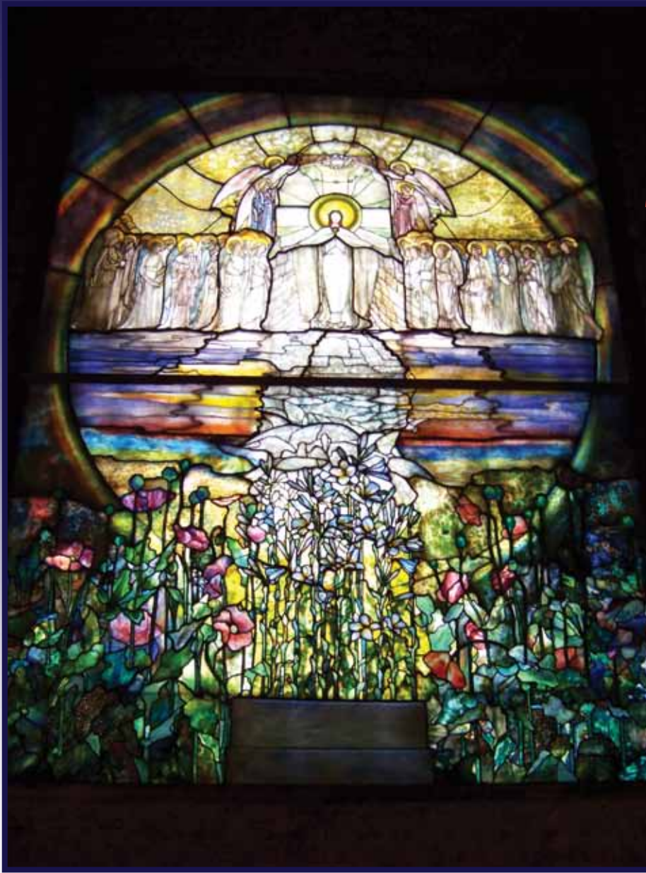
A Tiffany window in Wade Chapel.