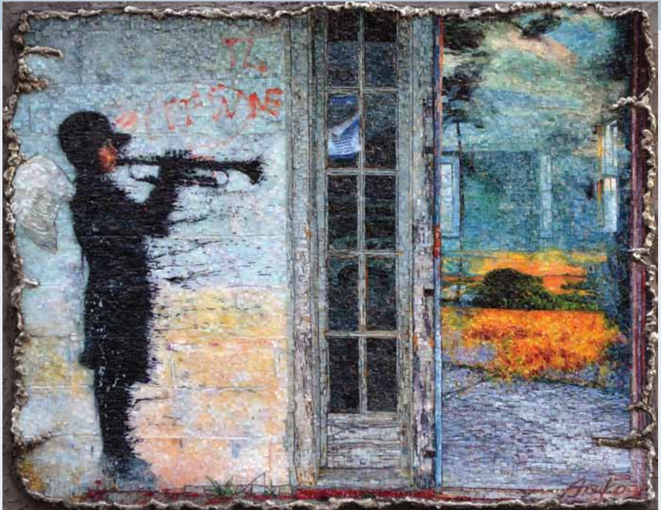
The Best in Show Fine Arts category awarded to Millenium by Laskaris Atsuko, stained glass, 22-1/2" x 27-1/2", 2015.

by The Staff of the Society of American Mosaic Artists