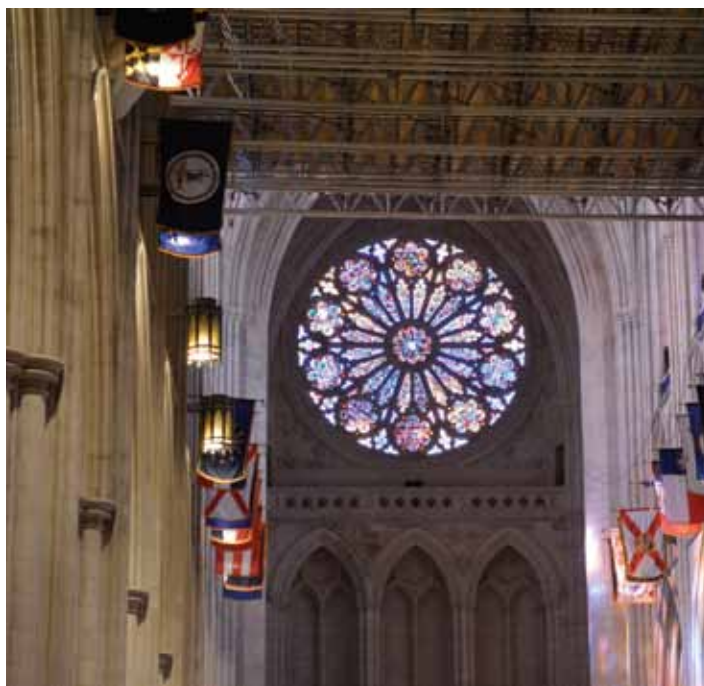
Rowan LeCompte's Rose Window in the National Cathedral.