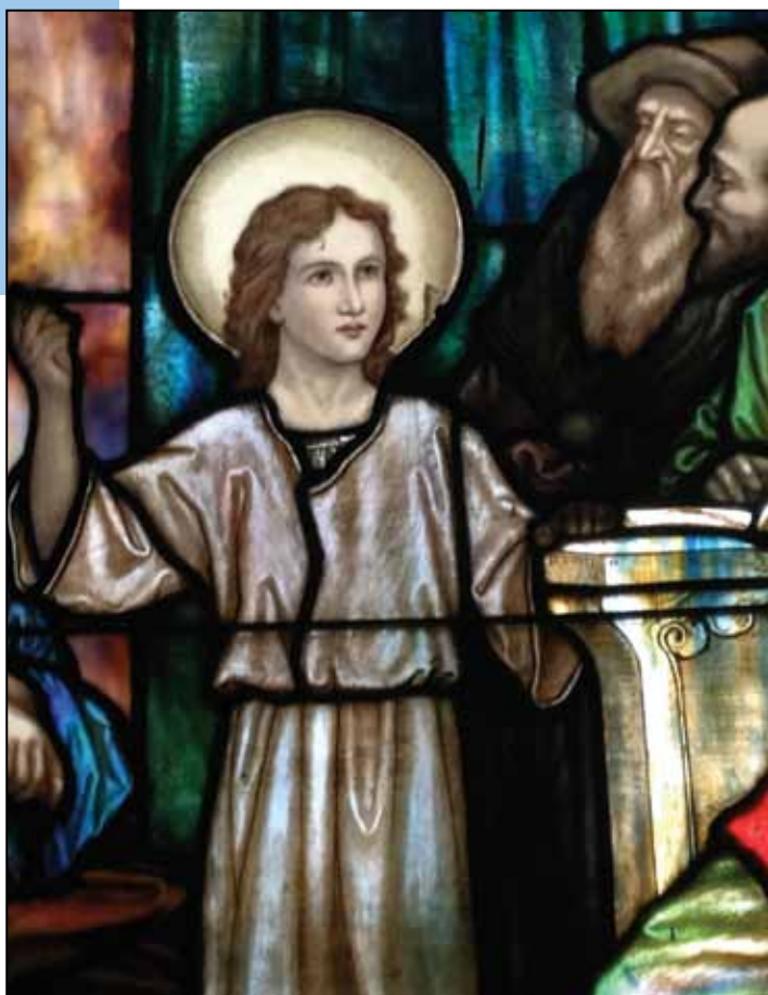
Window from the Rockville United Methodist Church, part of Sunday's tour.