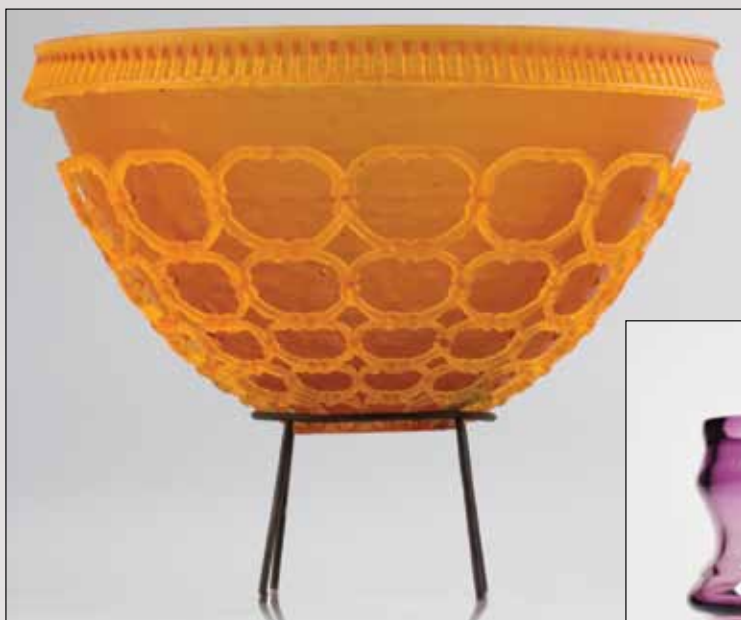
Ian Palfrey, Cage Cup, 17.6 cm x 10.4 cm, 2017.