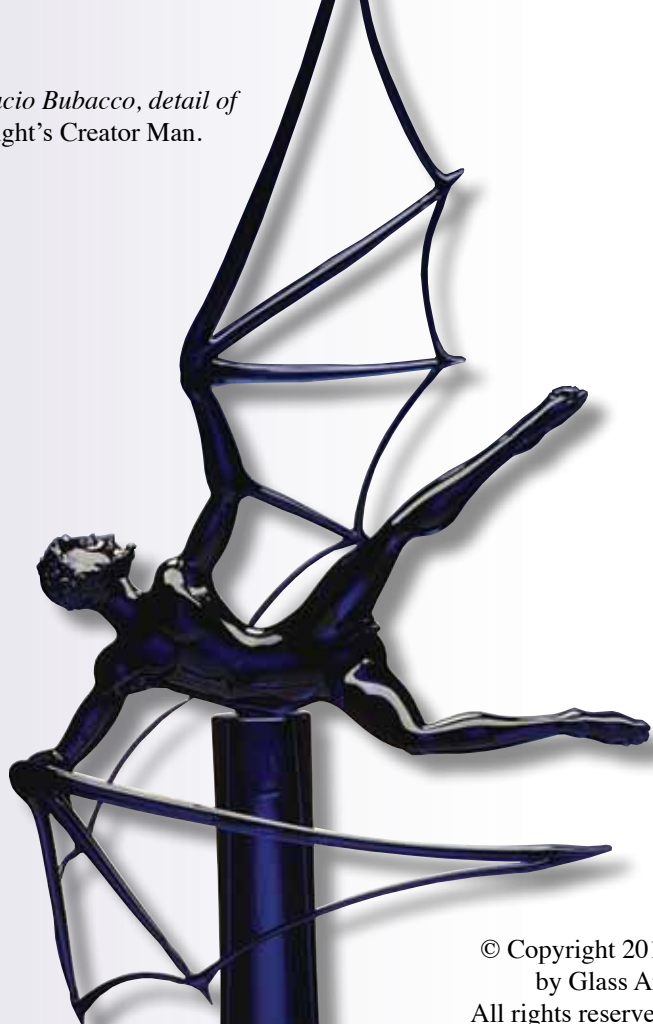
Lucio Bubacco, detail of Night's Creator Man.