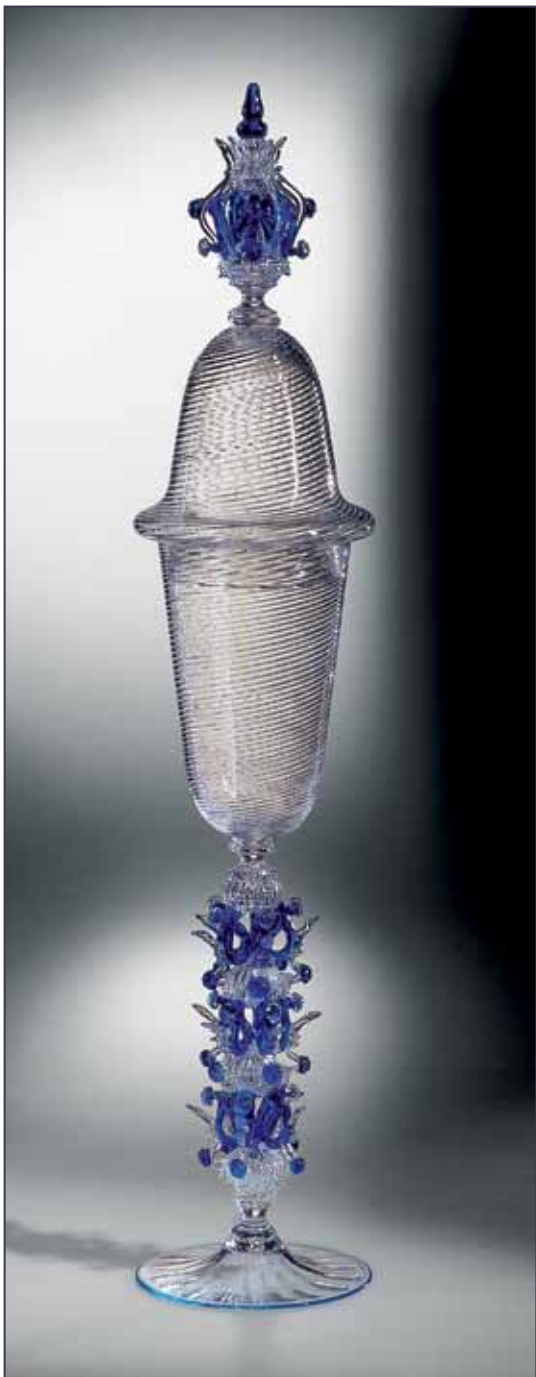
Davide Fuin, Cup Tipo on display at The Guggenheim, 54 cm, 2000.

Since 2000, Fuin has created over 65 pieces for his avventurina collection. He hopes to one day sell the collection as a whole to an art collector or museum.