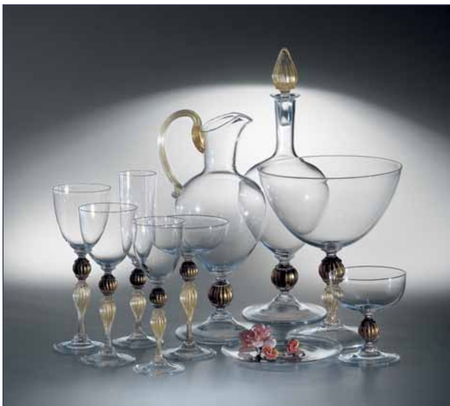
Davide Fuin, Glassware Set in various sizes, 2000.

There are a few small technical differences between glassblowing in the United States and in Italy. American glassblowers use the glory hole frequently, but on Murano it would mainly be used for larger work. Also, Italians use a fork-like tool to place work in the annealer versus the big silver astronaut-like gloves we see stateside. But the primary difference is philosophical, not technical. "On Murano glassblowing is work. It's not thought of as something one does exclusively for fun or artistic expression."