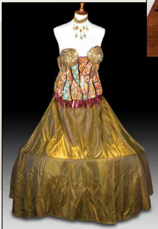
Carrie Strobe Aceso Corset Dress