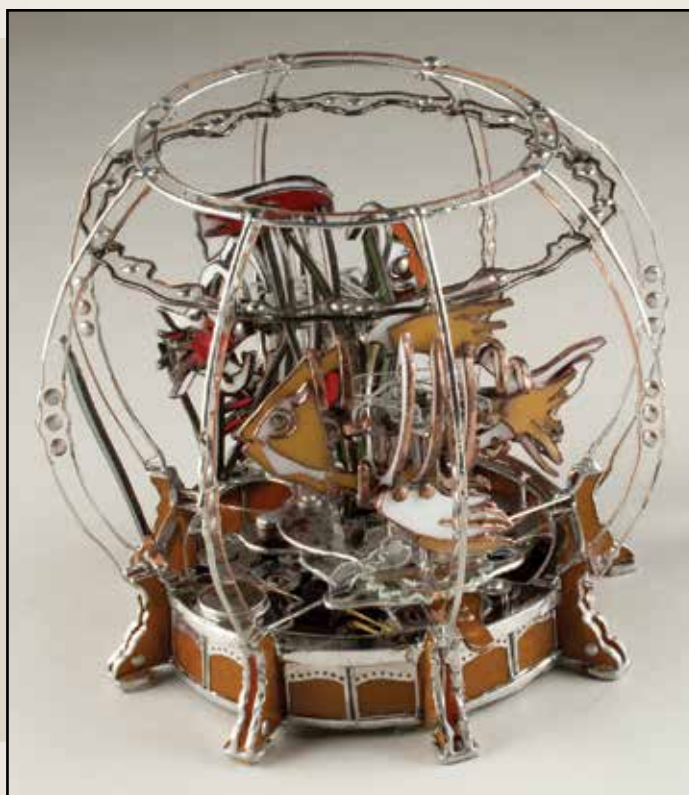
Gioia Boerrigter Round and Round and Round