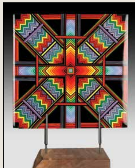
Tana Simmons Kaleidoscope