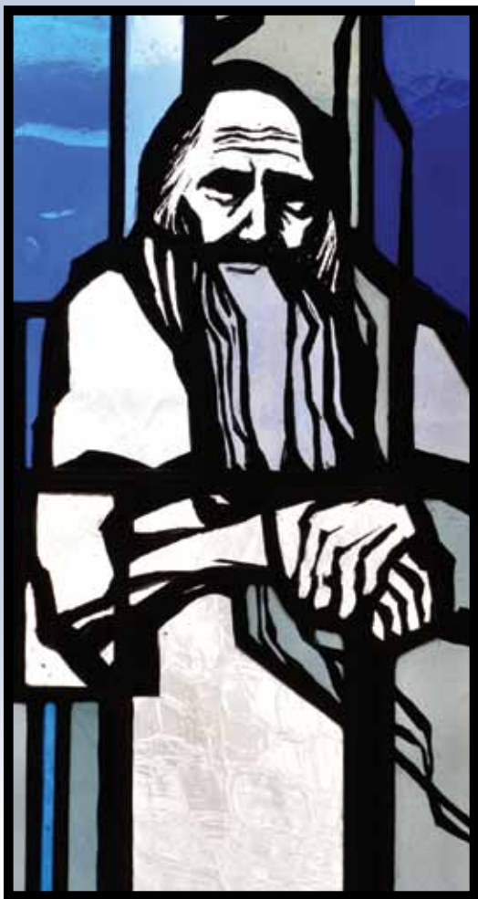
Brenda Belfield, Methusaluh window.