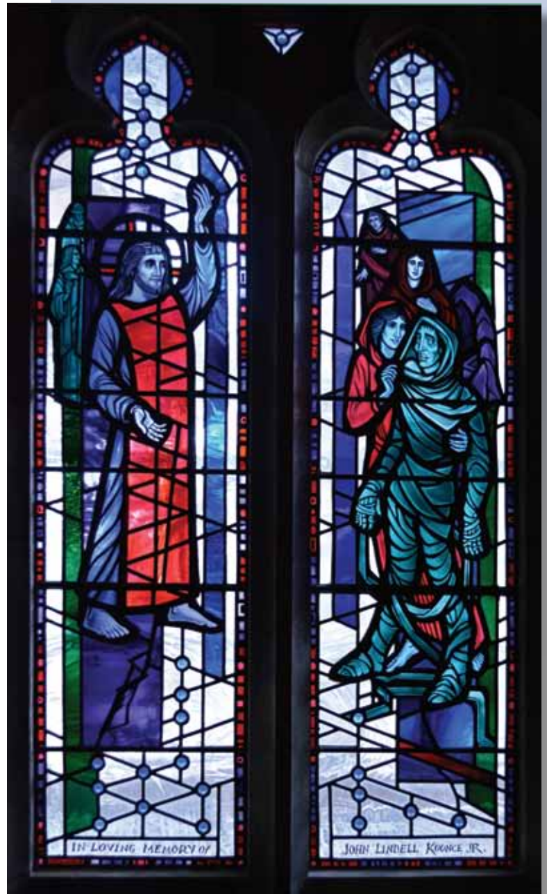
CZ Lawrence, The Raising of Lazarus.