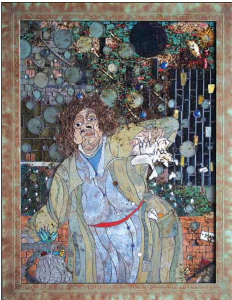
Brooks Tower, The Valley