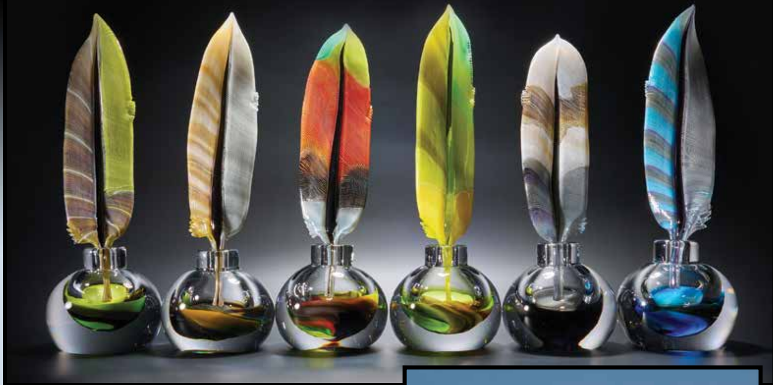
Layne Rowe, Ornithology , 41 cm x 80 cm x 3.5 cm, 2022.