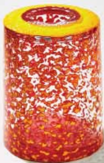
Ji Huang, Red Xipi Glass, 18 cm x 18 cm x 24 cm, 2019.