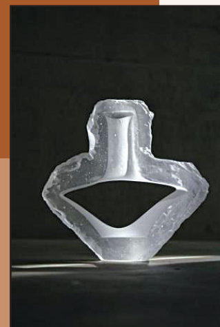
Linyu Mei, Montage.