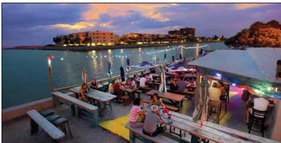
Sunset Dining on St. Pete Beach.

The GAS phone and fax numbers and all other contact information will stay the same.