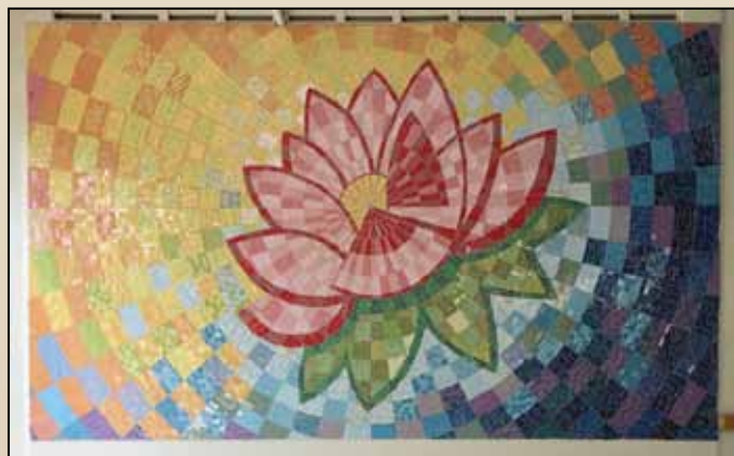
Joshua Winer, Just Like the Lotus

"This mural was created in conjunction with the Psychiatric Division of the American Embassy in Thailand and fabricated by hospital patients (adults and children), nurses, and volunteers. The four stages of the growth of the lotus is a metaphor for human development according to Buddhist text."