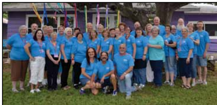
Attendees to RAGSfest in San Antonio, Texas.

Visit www.stainedglassretailers.com for more information on becoming a RAGS member.