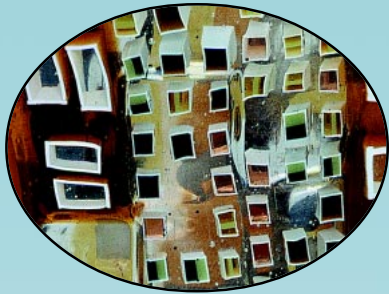
ON THE COVER: Billet #28, Giles Bettison, 9.5" x 5.5" x 2.5", 2005. Formed using a hot glass blowing technique without being inflated, maintaining the integrity of the patterns and the thickness of the vessel wall. Ground and polished.