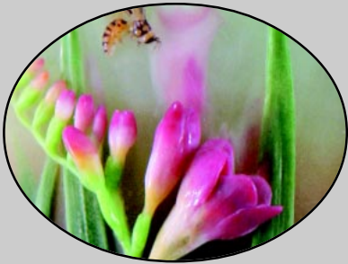
ON THE COVER: "Freegia," Kimiake Higuchi, 22 x 34 x 54cm, pâte de verre, 2005.