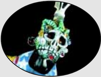
ON THE COVER: "Cuautemoc," Einar and Jamex de la Torre.