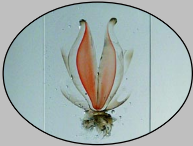
ON THE COVER: "The Secret Life of Plants," Steffen Dam, 34" x 26" x 10", 2006.