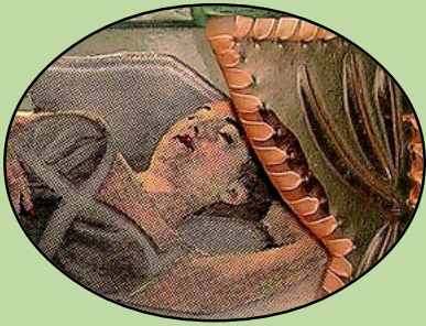
ON THE COVER: "Sleeping Beauty's Dreamless Sleep," Susan Taylor Glasgow, 24" x 19" x 14", 2006. Fused, slumped, sandblasted, glass enamel, stitched with nylon ribbon.